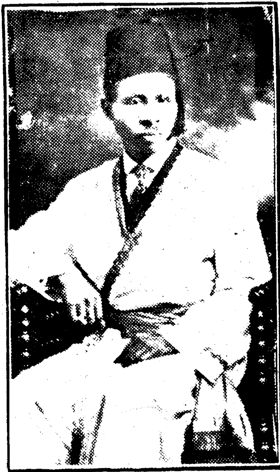
NOBLE DREW ALI

THE PROPHET AND FOUNDER OF THE MOORISH SCIENCE TEMPLE OF AMERICA, TO REDEEM THE PEOPLE FROM THEIR SINFUL WAYS.